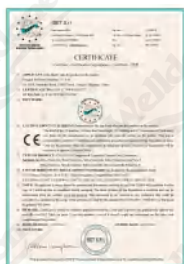
CNG DISPENSER CE