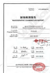
RADIOGRAPHIC EXAMINATION REPORT