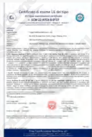
LNG DISPENSER ATEX