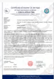
MOBILE GAS STATION ATEX