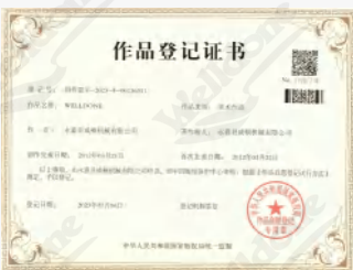
PATENT CERTIFICATES FOR MANAGEMENT SYSTEM