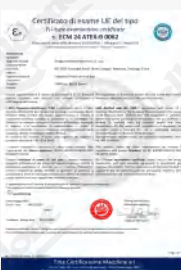
JUNCTION BOX ATEX