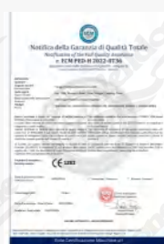
LNG DISPENSER PED