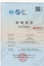
PQR TEST REPORT