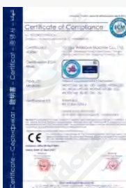
POSITIVE DISPLACEMENT METER CE