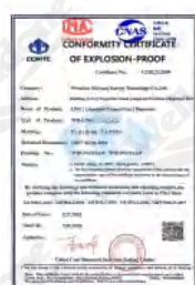
LNG DISPENSER EXPLOSION PROOF