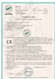
LNG DISPENSER CE