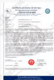
SUBMERSIBLE TURBINE PUMP ATEX