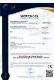
ABBLUE DISPENSER CE