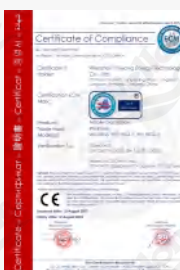
MOBILE GAS STATION CE