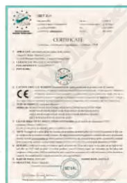
FUEL DISPENSER CE