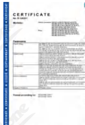
EV CHARGER TUV