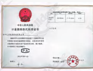
CNG DISPENSER PAC