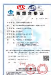
CNG DISPENSER EXPLOSION PROOF