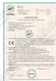
LPG DISPENSER CE