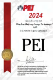
PEI MEMBER CERTIFICATE