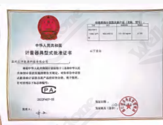
LNG DISPENSER PAC