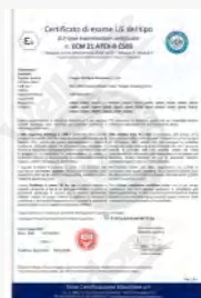
FUEL DISPENSER ATEX